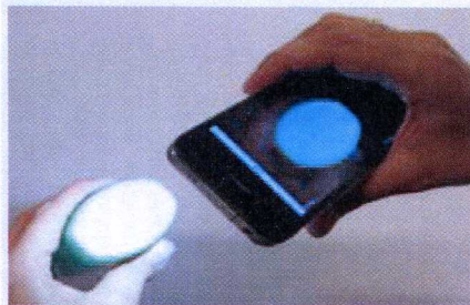
Figure 2 Covert security (Alpidrin box)

require an off-the-shelf office flatbed scanner or an iPhone 4 smartphone device to perform a "genuine-or-fake" verification. In this case, the covert feature scanner can be purchased on the consumer electronics market anywhere, while proprietary hardware is the rule when security substances, taggant or dedicated invisible optical effect are used.