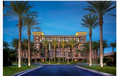
The Westin Kierland Resort & Spa, Scottsdale, AZ