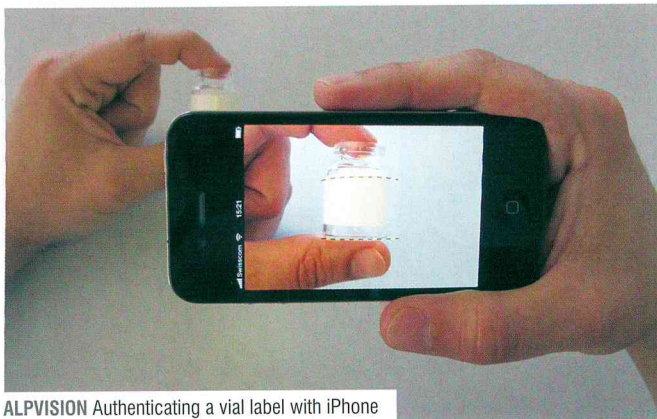
ALPVISION Authenticating a vial label with iPhone

CAROL HOUGHTON rounds up the latest news in smart and intelligent labeling