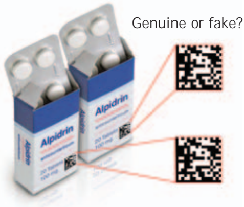
Figure 1: Serialisation using barcodes or matrix codes cannot be used to assess which item is genuine and which is fake, in the case where the fraudulent replication is well executed. Only additional efficient authentication features can securely guard against counterfeiting.

between two items that are strictly identical and with matching identification features. It helps combat counterfeiting of medicine by criminal organizations who are equipped with the same manufacturing facilities as the genuine pharma manufacturers.