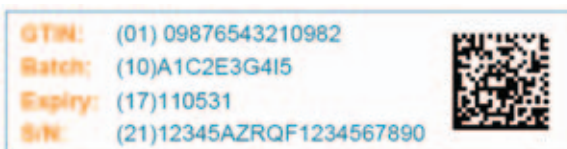
Figure 2: Example of the coding adopted for a pilot project conducted by the European Federation of Pharmaceutical Industries and Associations (EFPIA) held in Sweden between September 2009 and January 2010 (2). It shows both human readable and machine readable information. GTIN is a global trade number provided by the GS1 non-profit organisation; the coding shows a batch number, the expiry date and an individual serial number. This information is also contained in the 2D barcode for machine readability.

January 2011 will cover only part of the production of pharmaceuticals and not all pharmacies will have installed 2D barcode readers. However, in view of the existing human readable information on the packaging, manual recording of the batch serialisation code of an item remains possible at any point in the supply chain. No centralised system is currently defined and pharma manufacturers are only required to record this information on their own premises.